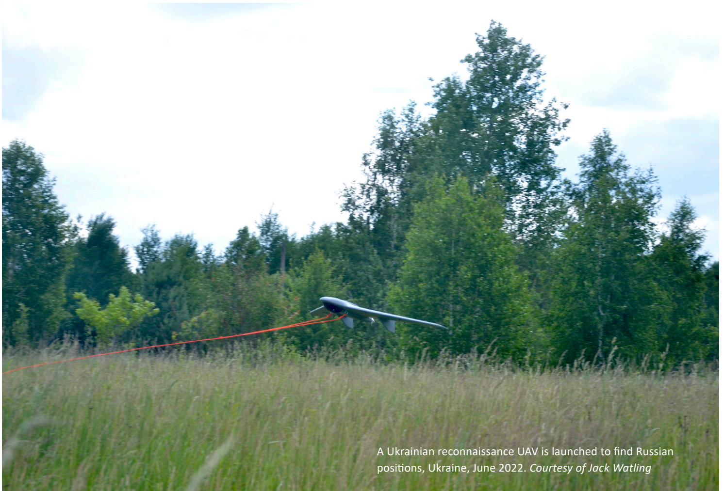
A Ukrainian reconnaissance UAV is launched to find Russian positions, Ukraine, June 2022.

and its repurposing from a long-range precision-strike system to part of the tactical artillery system. Although Tochka-U is often used by Russian forces to target EW units and command posts located in the enemy rear, it has become valued for its large high-explosive warhead, which Russian forces seem to view as effective against a wide variety of targets for which it was not originally intended. This has sometimes manifested in acutely inefficient targeting. In one engagement, a single Ukrainian M109 howitzer was targeted by three Tochka-U strikes. The crew were forced to temporarily abandon the howitzer in order to seek hard cover, but it survived with light damage that could be repaired in a few hours with some basic spare parts. 28