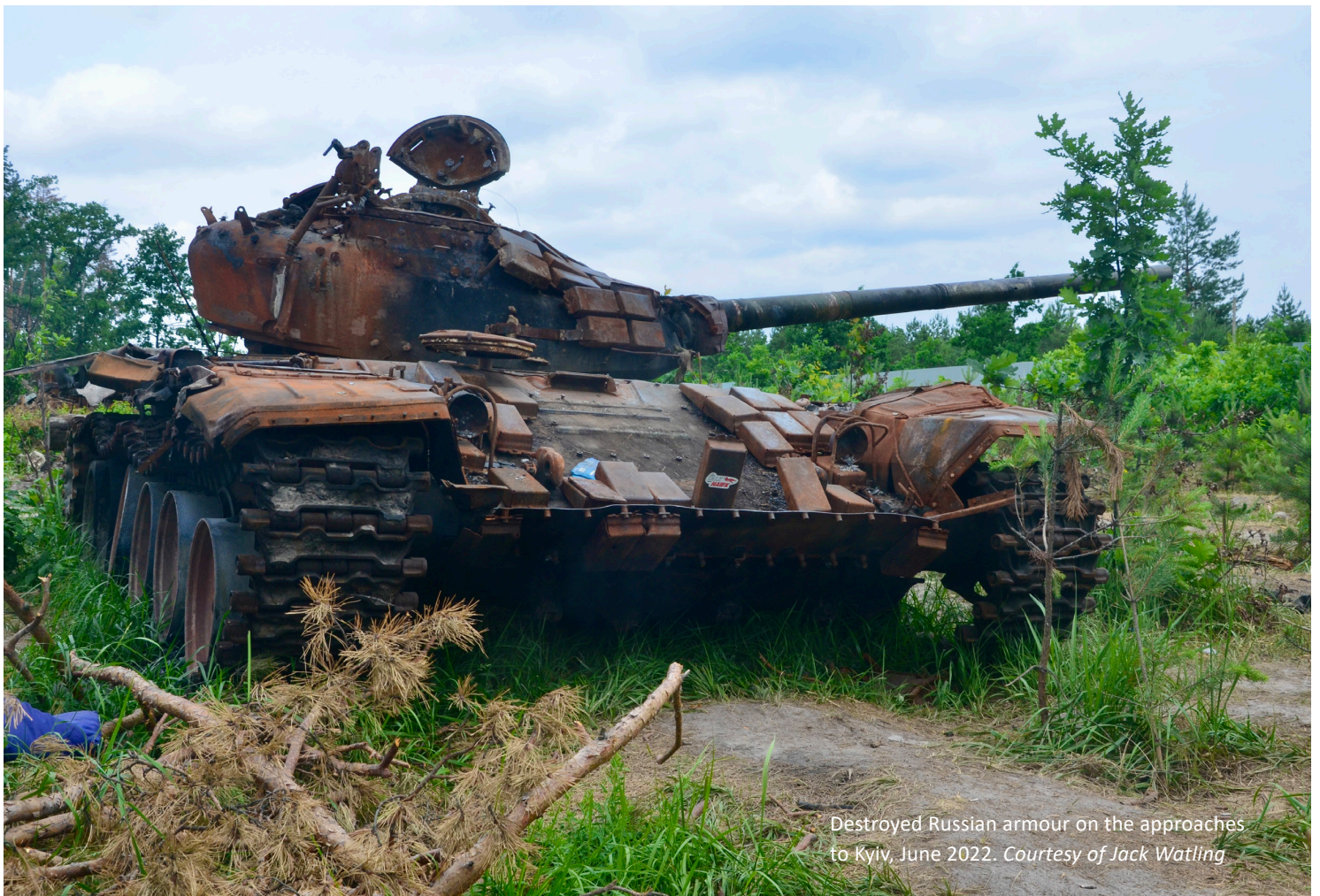
Destroyed Russian armour on the approaches to Kyiv, June 2022.

alongside a literature review of press coverage and academic writing about the war. The report takes into consideration, but largely discounts, Russian military performance and especially tactics, techniques and procedures documented during the first three weeks of fighting 2 because the operational context makes these anomalous. To avoid similar contextual factors leading to overly broad conclusions, the report seeks to document consistent Russian behaviours and proficiencies observed between multiple fronts, such as in Donbas, Kherson and in some areas around Kyiv. It neglects a detailed examination of Russian unconventional operations and Ukraine's maritime flank. These are important topics that should be examined separately. Instead, this report focuses on the dynamics of ground operations.