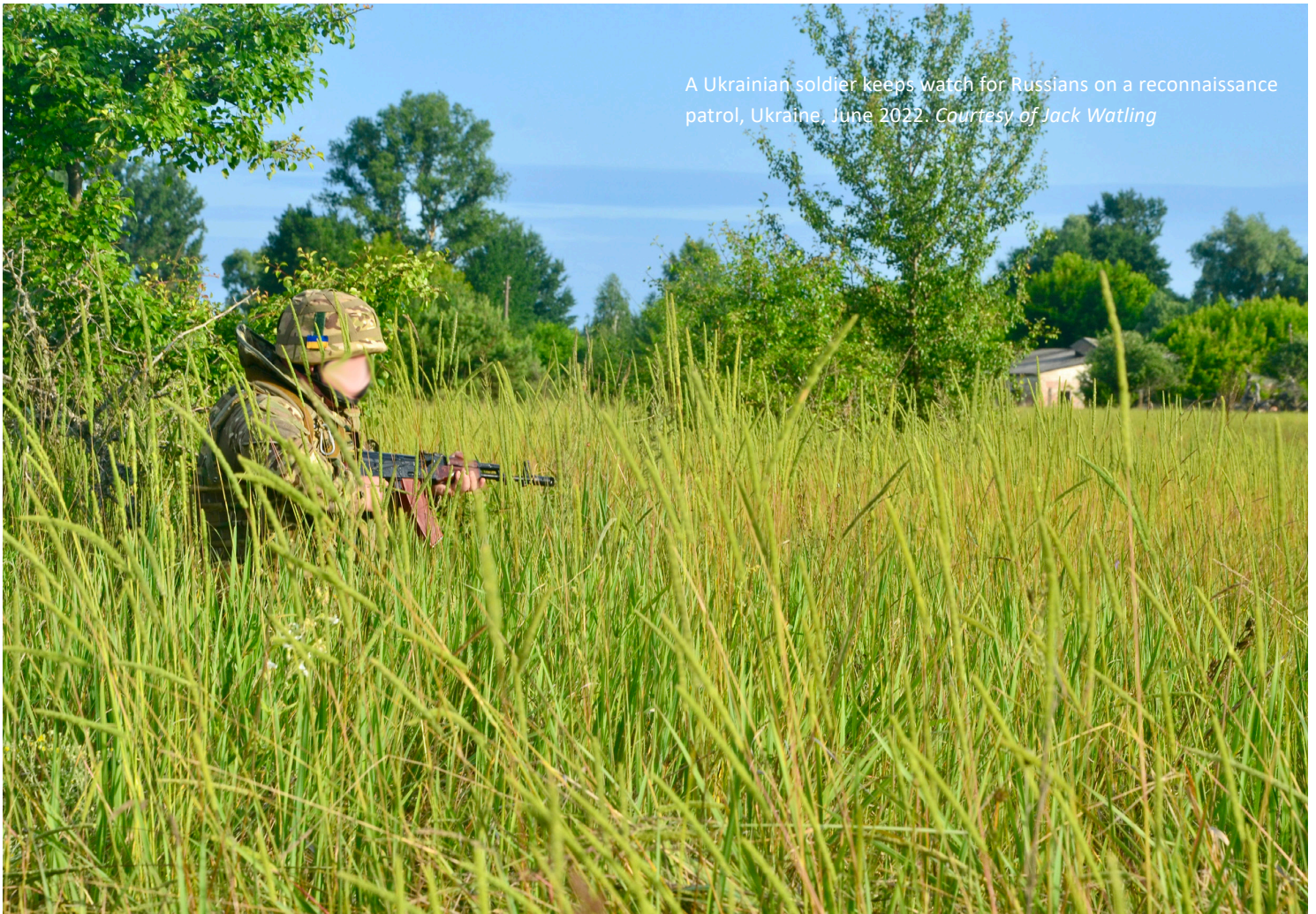
A Ukrainian soldier keeps watch for Russians on a reconnaissance patrol, Ukraine, June 2022.

assesses that it has 1.6 million people within its current target group for mobilisation. Ukrainian officials are predicting that 9 million Russians will be unemployed by the end of the year, potentially increasing those volunteering for service. 49 Nevertheless, the draft appears extremely unpopular and even among hard Russian nationalists is seen as a signal that the government has conducted the war incompetently. Furthermore, bottlenecks in government records, training capacity and equipment serviceability mean that the Russian government cannot pull all these individuals into uniform in a short space of time. Instead, the process of mobilisation is anticipated to be an ongoing one.