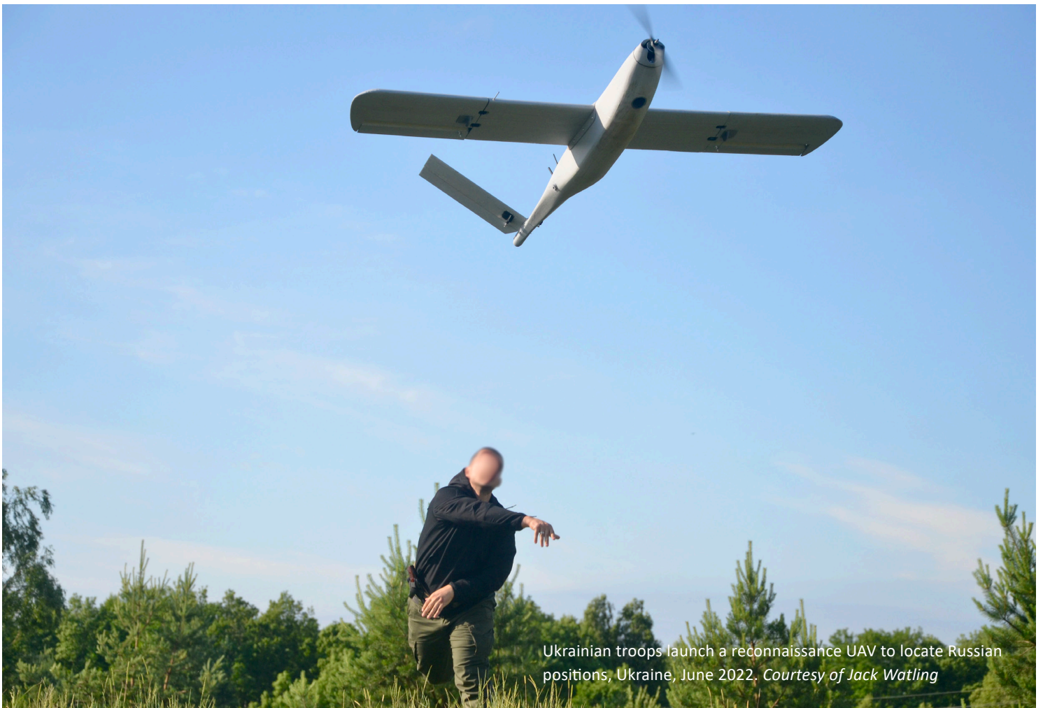
Ukrainian troops launch a reconnaissance UAV to locate Russian positions, Ukraine, June 2022.